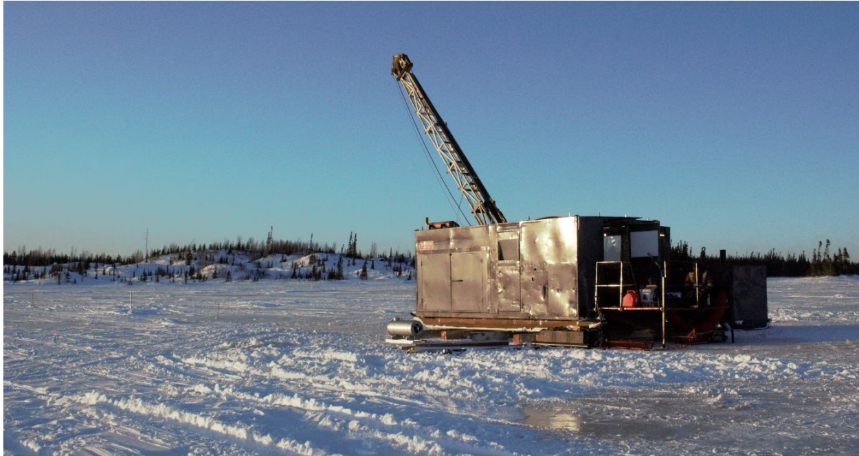
Figure 2. Drilling now underway at Renault

Zach Flood, CEO of Kenorland states, “We’re delighted to have the drills turning again on this incredible discovery. In mineral exploration, the odds of finding a completely new, and significant gold system are extremely rare. I believe we’ve succeeded in that and the objective now is to expand the footprint, and define the limits and continuity of mineralization.”